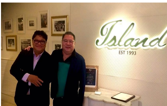
At the entrance of the Island Café @ Tangs