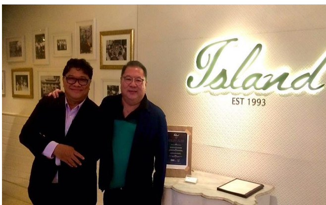
At the entrance of the Island Café @ Tangs